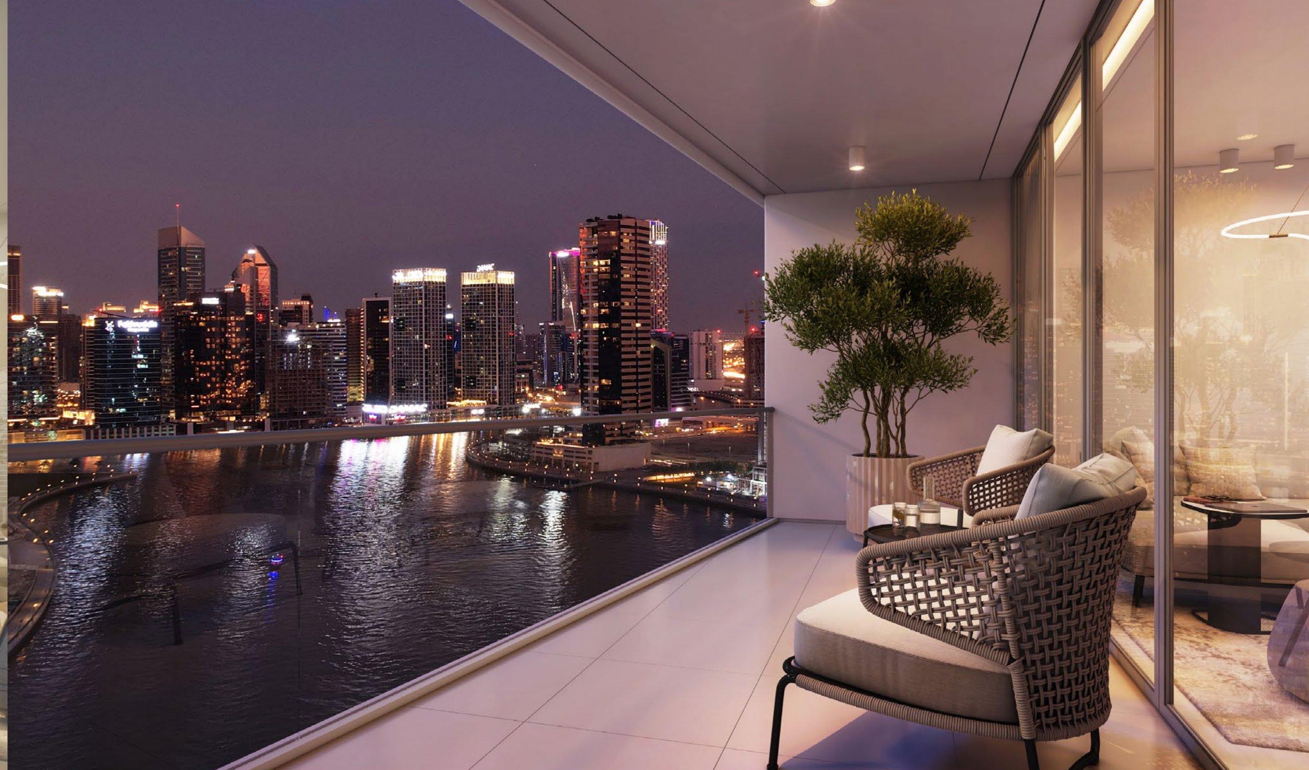
NORTH-EAST NIGHT VIEW