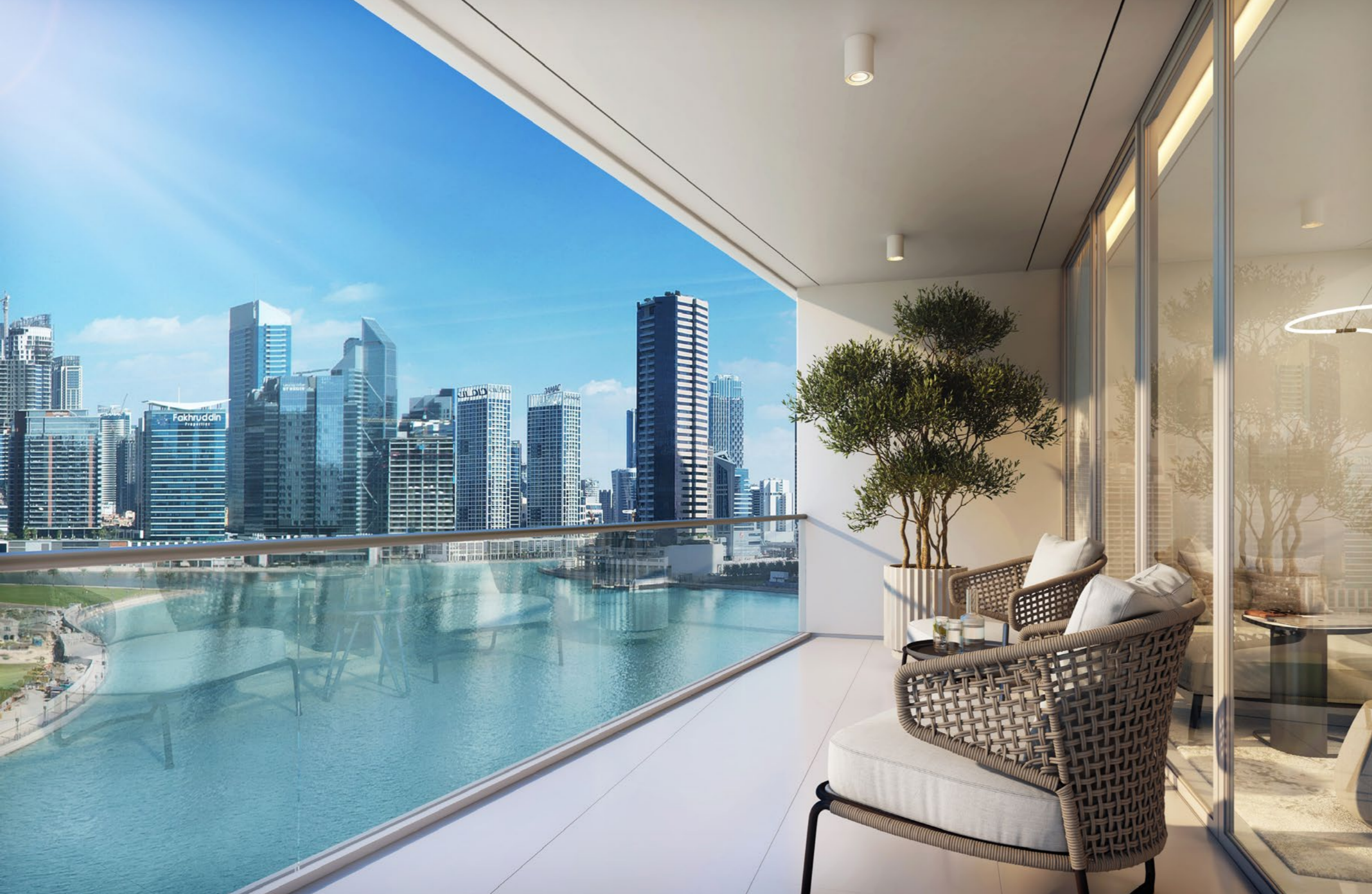
NORTH-EAST DAY VIEW